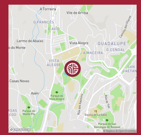
Santiago Airport 14.19 Km / 20 min. Santiago Cathedral 0.75 Km / 10 min. Santiago Chapter House 0.75 Km / 10 min

Avenida Burgo das Nacions s/n 15705 Santiago de Compostela Spain